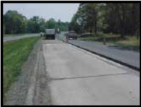
Surface condition after milling

Previous Condition: HMA overlay over PCC Joint Spacing: 30' Reinforcement: Doweled Surface Preparation: Milled to PCC